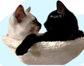
Breezy & Hubble