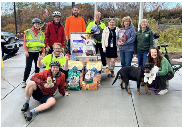
Thanks to Quincy Cycles for including us in the Cranksgiving ride again this year.

Purrs to everyone who donated raffle items and gift cards to support our events!