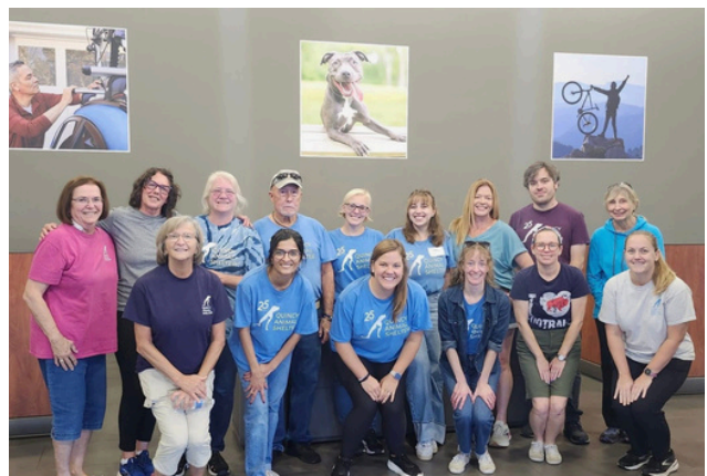
Quirk Subaru Free Microchip Clinic