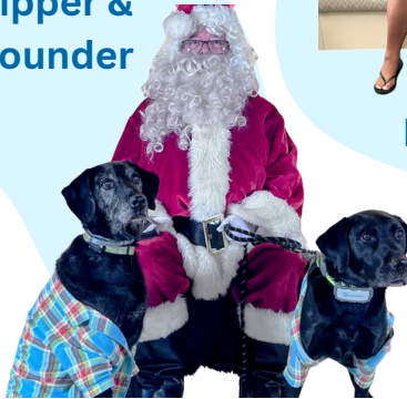
Flipper & Flounder