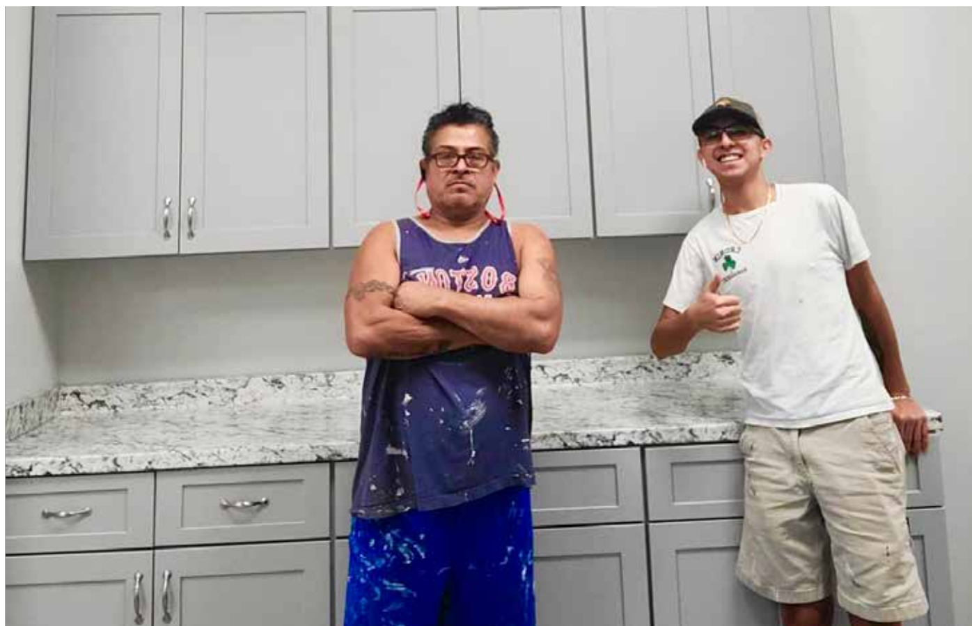
GF Kitchen & Bath donates an amazing prep kitchen!