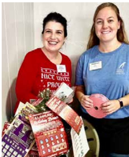
Raffle tickets available until Dec 10th