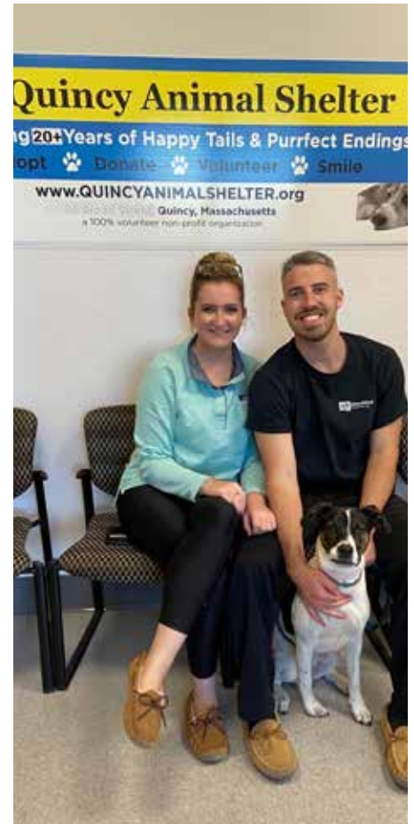
Pookah's New Family