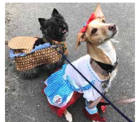
Dorothy & Toto