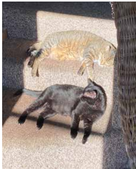
Blue & Bruin Soaking Up the Sun

Jack, a young tabby, is comfortable in his new home! Their resident cat is touching and smelling, but there is no hissing. They think he is a great cat!