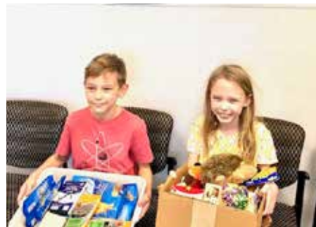
Kids That Care