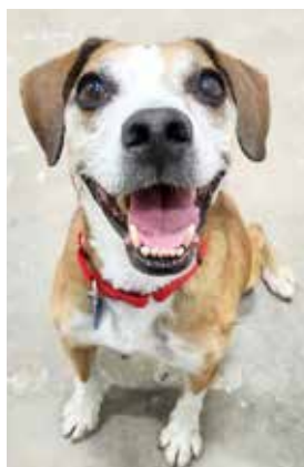
Eddie, the Beagle