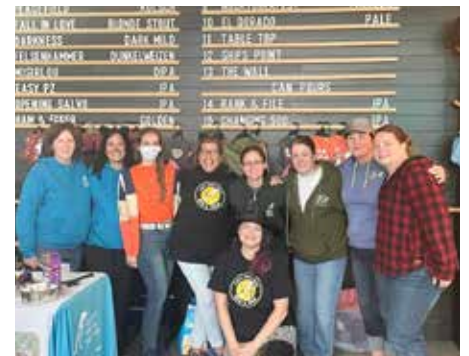
Break Rock Bunch