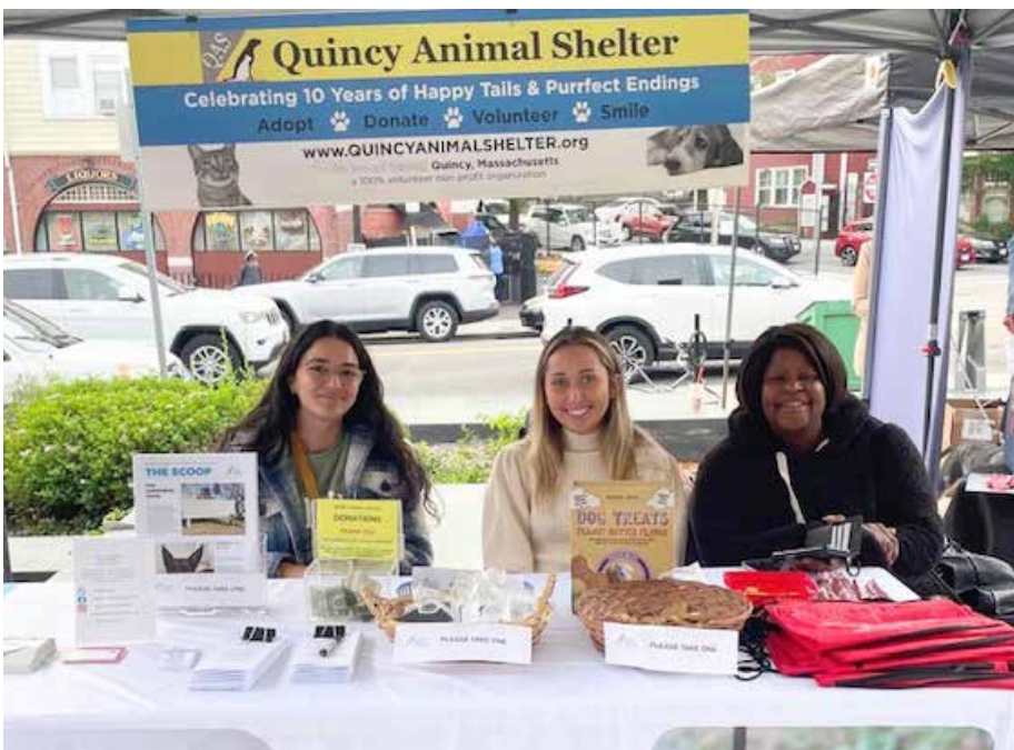
Ashmont Farmers Market