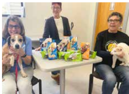
Sweet Treats from the Girl Scouts

Some of the most generous and selfless acts of kindness come from kids. Since our early days we have welcomed kids of all ages into the shelter loaded with donations for our animals. They have had lemonade stands, made blankets, held food drives at schools and even forfeited birthday presents by asking for gifts for the animals. When they visit the shelter, they get a tour, and we snap some photos. These are great kids. I am sure their parents are proud too. Kids who love animals are incredibly special to us.