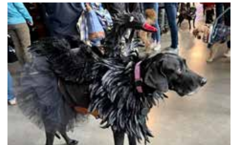
The Winner: Black Swan

We also want to thank all crafters and volunteers who made our Annual Craft Fair a success.