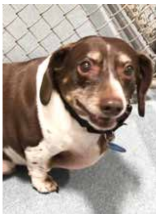
Bentley Needs a Home!