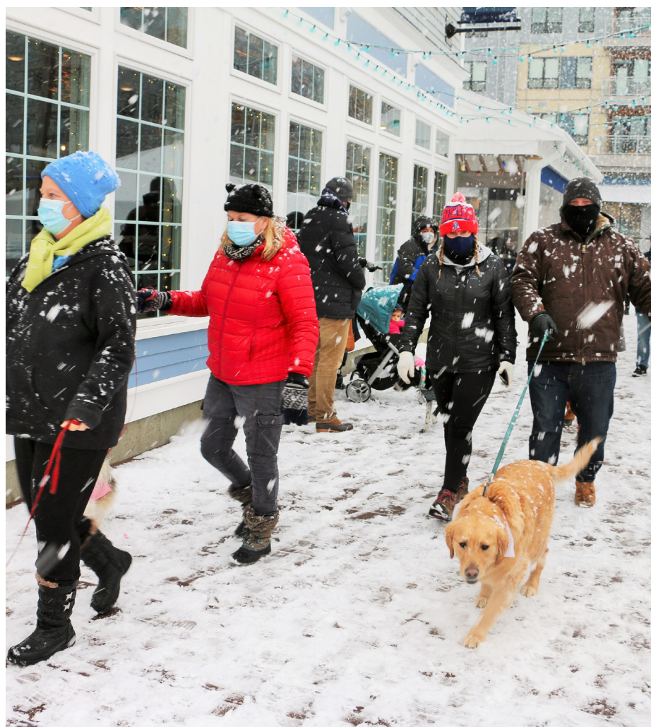
A little snow didn't stop the Puppy Parade