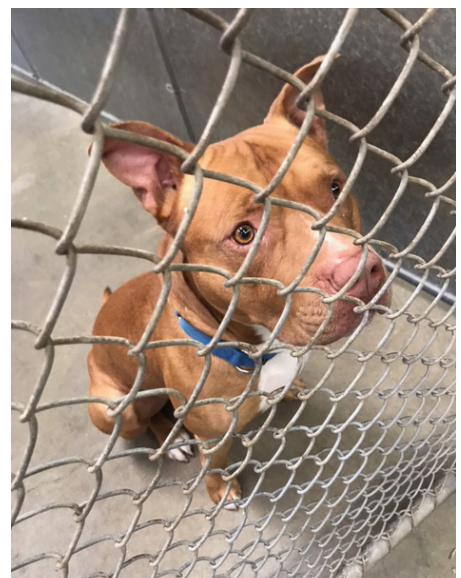
Doggy jail is safer than roaming the streets

QAS abides by all applicable laws regarding stray animals.