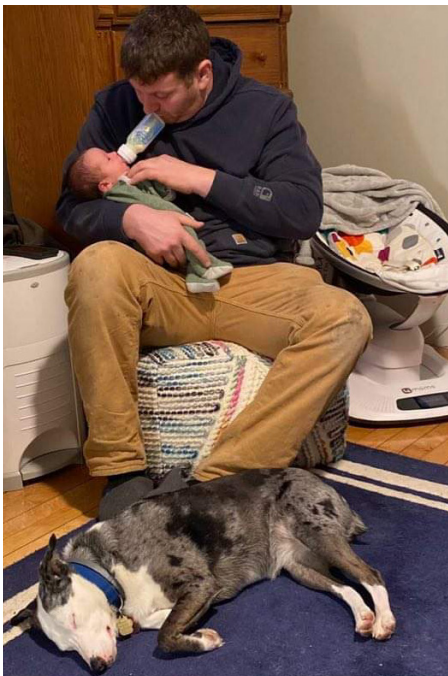
Maggie's new family