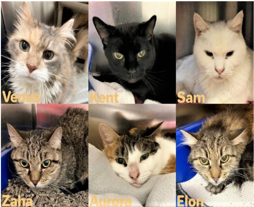
The Senior 6 - No Such Thing as A Mid-Life Crisis