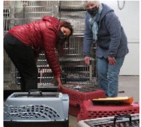
The Mexicats are here!

which we will take care of. They came to us already spayed and neutered, combo tested and had their initial vaccines. These cats were found in the streets or given up by owners and the chances of them finding homes was bleak. It has been a wonderful experience to be a part of this rescue effort! We are so happy that we are able to be involved in finding homes and happiness!