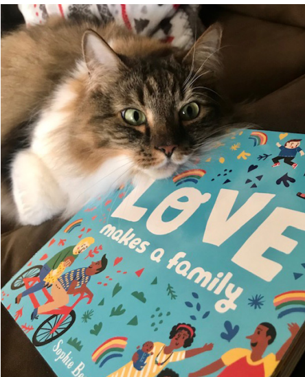
Lassie knows all about love in her house!