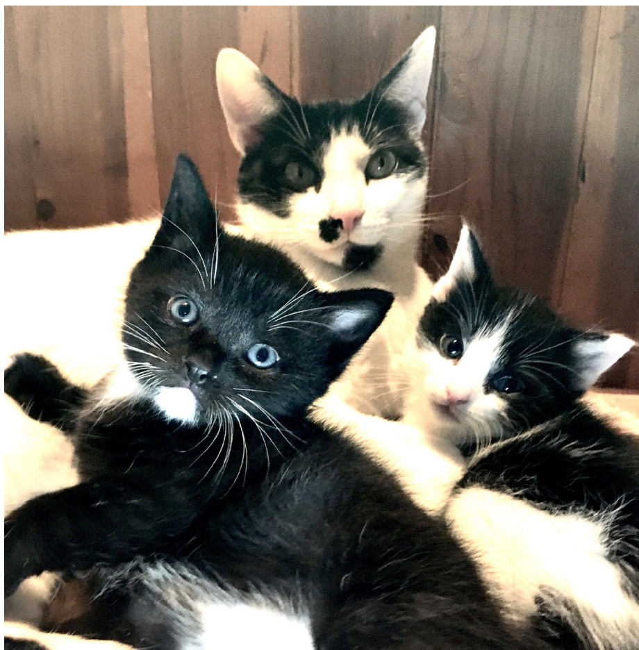
Necco, Taffy and Mom

Do you ever wonder what it means when QAS states we are a no kill shelter? I did when I began volunteering here in 2013. There have been times when sick dog or cat was assisted in crossing the rainbow bridge to save them from unnecessary suffering. I had cared for many of them and knew it was the best choice. Many have been placed with hospice fosters to live out their days being loved.