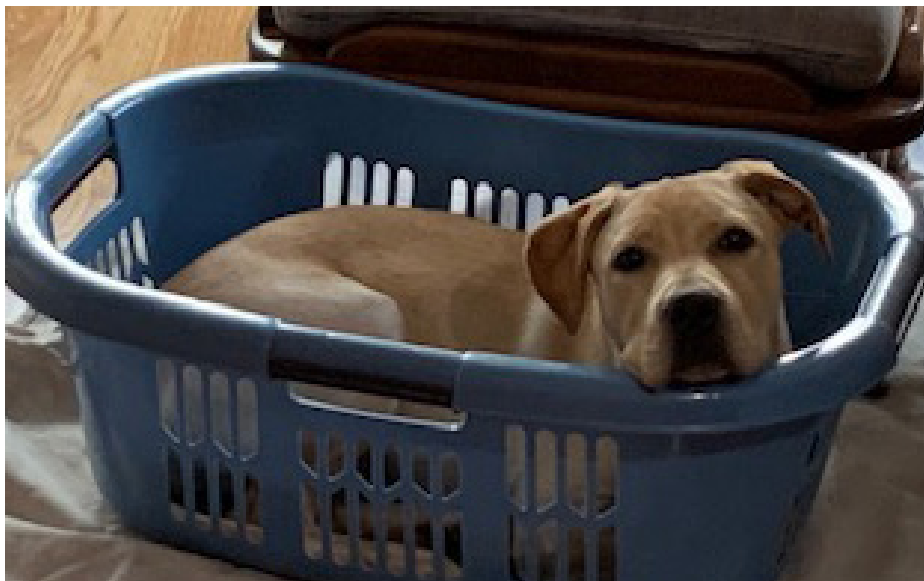
QAS Alumni Cali

We sent many lucky pups home to already this year. Thank you to all of the families who opened their homes and heart to these cuties. And thank you to our canine and adoptions teams for making all of these fantastic matches!