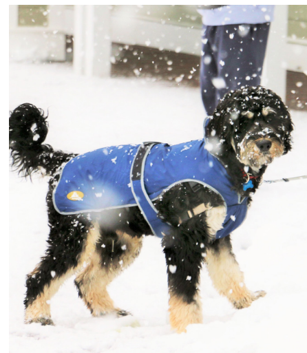
Puppy Parade 2021