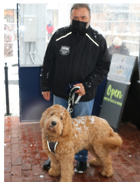
Puppy of the Year, Bubbaloo