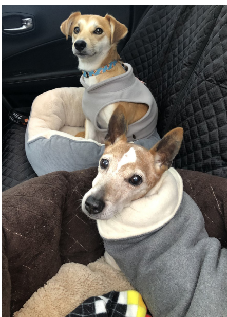
BFFs Rocky and Foxy

Rocky was a volunteer favorite too. May you rest in peace. Rocky.