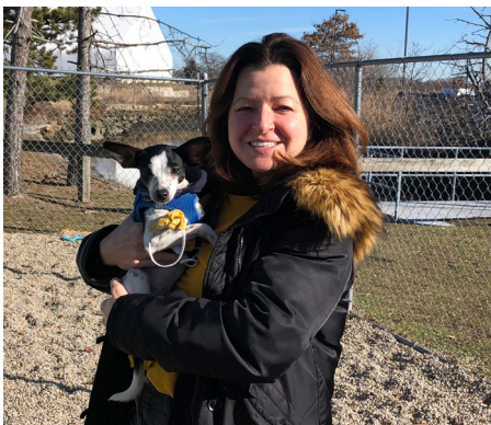
Dora off to live the dream on the Cape