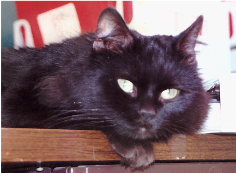
Photo of Wesley in QAS Office 2000

Wesley was brought to us by someone who thought they were doing the right thing. They brought him to QAS but we were not open, so Wesley was tied to the street sign outside with a rope around his neck. Terrifying treatment for any cat to endure, he fought to get free nearly choking himself and permanently scarring his neck. The trauma was overwhelming, for a period of many months, volunteers worked tirelessly to calm Wesley and gain his trust. His neck healed, his hair grew back, but his trust in humans had not. He was sweet one minute and on guard the next. He would strike without warning and had become a danger to those trying to desperately to help him. Even medication did not diminish the fear. The damage was done and he could not be rehabilitated. This was devastating. Wesley deserved better. In his name, a fund to help the truly homeless and helpless cats was created in his honor and to preserve his memory. Wesley's Wish helps fund our feral cat program which helps control the cat population in Quincy through a Trap, Neuter, and Release program.