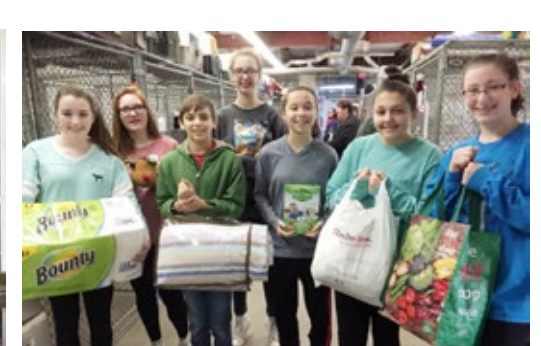
Immaculate Conception Church of Weymouth - CCD class grades 7 & 8