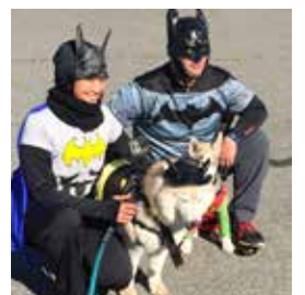
Last year's costume winners back as Batman, Batgirl, BatDog & Robin