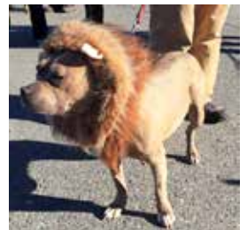
QAS alumna Cowie the Lion