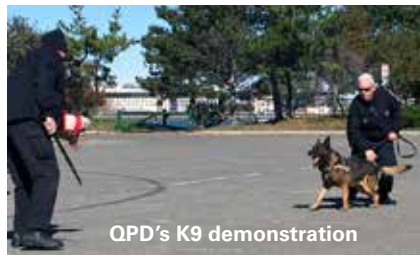
QPD's K9 demonstration