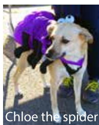
Chloe the spider