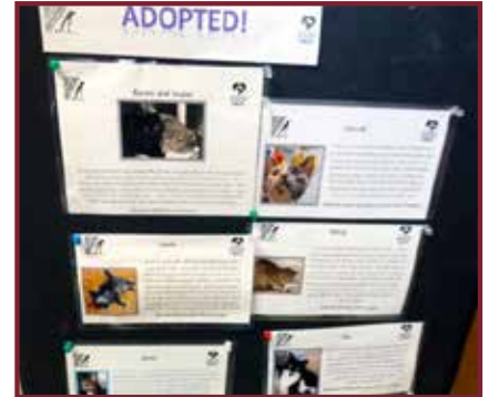
Success! Eight cats and seven kittens found their forever homes during Clear The Shelters Day.