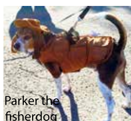
Parker the fisherdog