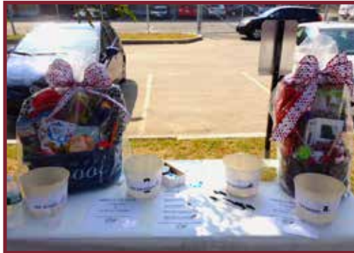
Visitors purchased raffle tickets for a chance to win a Red Sox tickets, a dog or cat gift basket, and a $50 gift card.