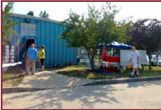
QAS volunteers and visitors enjoyed fresh air and beautiful weather during Clear The Shelters Day.