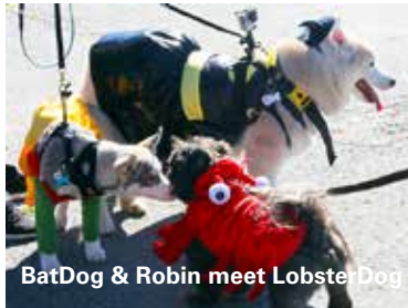
BatDog & Robin meet Lobster Dog